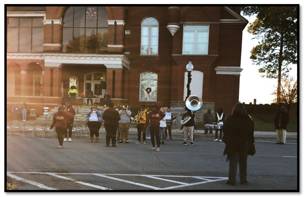
Dooly County High School Band Ensemble