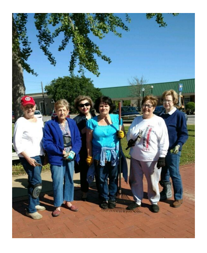
Vienna Garden Club Adopted Downtown City Square