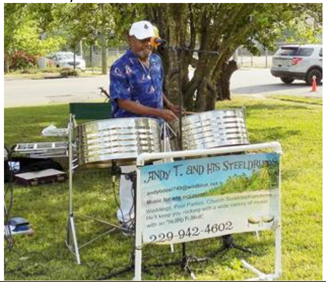
Live Entertainment Sponsored by Dooly County Businesses