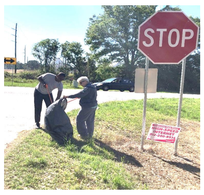
South Georgia Banking Company Adopted Highway 41 from Bank to Andrews Street