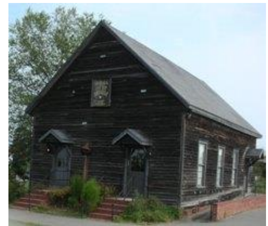
Georgia State Cotton Museum

In 1908, the United Daughters of the Confederacy erected a monument to the soldiers of the Confederacy. It is located in the Downtown Square.