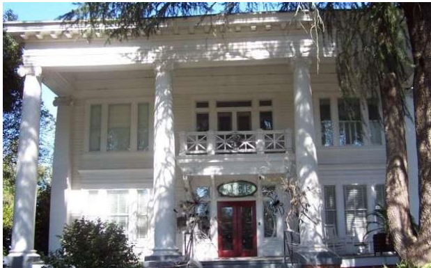
One of our beautiful historic homes.

Visit our unique shops downtown where you will find boots and western wear, a trove of unique collectibles, baby gifts, just the right outfit for almost any occasion or that perfect gift for the special someone in your life. You can even pamper yourself with a new hairstyle or even get a manicure/pedicure right here in beautiful downtown Vienna!