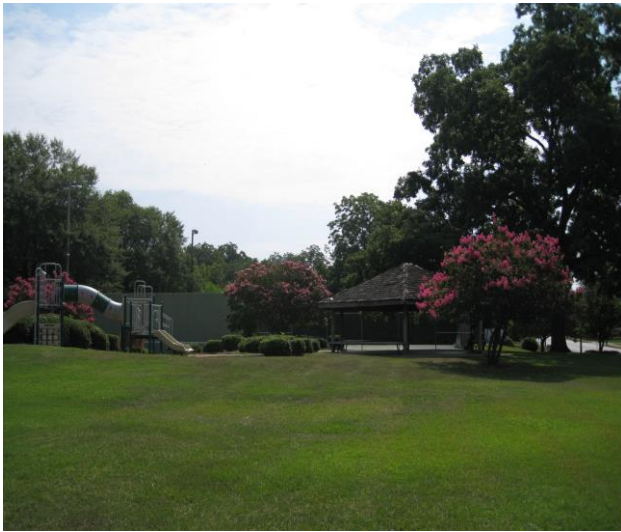
George Busbee Park and Tennis Courts

Barbeque is not our only call to fame. You can delve into a rich history and culture to learn about Vienna's most notables - from Hollywood screen writer, an Olympic athlete, governors, senators, poets, authors, and artists. Vienna has produced its share of unique and famous individuals. Some of their homes still exist today.